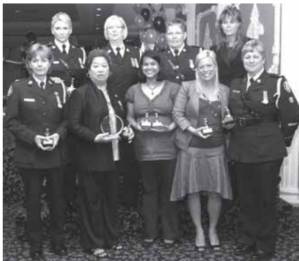
Team Endeavours, Toronto Police women Build Team