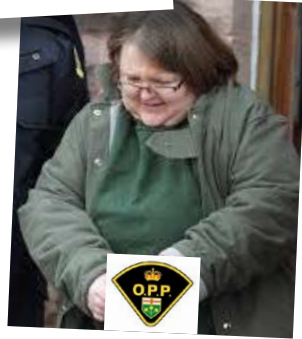
OPP Presents the Elizabeth Wettlaufer Case Study "Nurse pleads guilty to murdering 8 long-term care patients"